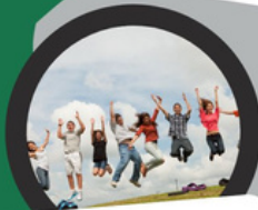
Activities & More!